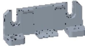
PLASTIC MOUNTING CLIP GWL-ALU-D-C