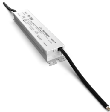
80W, 100W, 150W LED DRIVER FSL-LD2-XXX24V