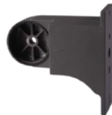
FLAT ARM MOUNT